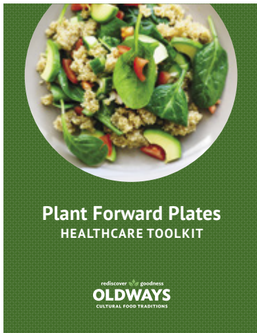
Plant Forward Plates HEALTHCARE TOOLKIT

rediscover goodness OLDWAYS CULTURAL FOOD TRADITIONS