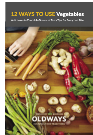
12 WAYS TO USE Vegetables Artichokes to Zucchini—Dozens of Tasty Tips for Every Last Bite

A 28-day guide for creating satisfying, balanced, budget-friendly meals for a healthy plant-based diet.